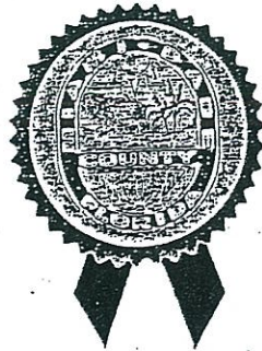
Alex Penelas Mayor

In Observance Thereof: I call upon the good people of Miami-Dade County to join me in recognizing all the staff at this higher learning facility for their commitment and dedication towards preparing our youth for a brighter tomorrow.